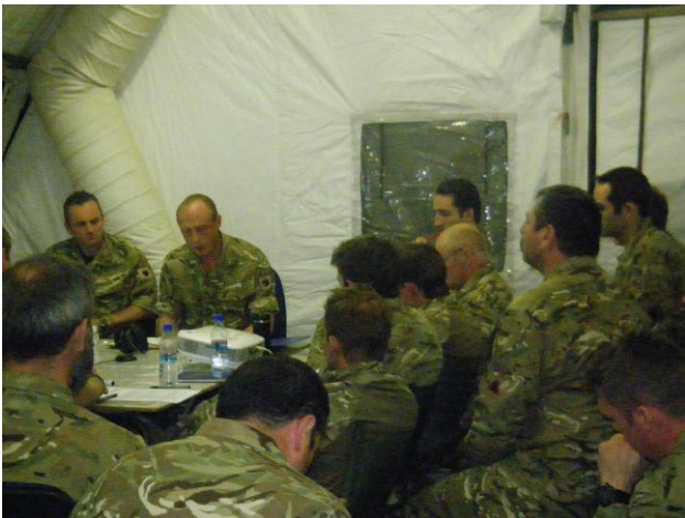
Members of the HERRICK 18 PMAG Headquarters attend one of our evening briefings.