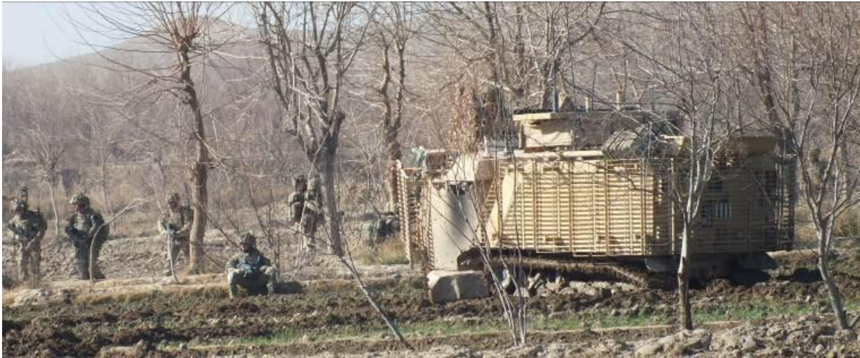
Intimate support to the BRF in Yakchal