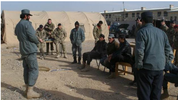
AUP student instructors show off their skills at PPHQ