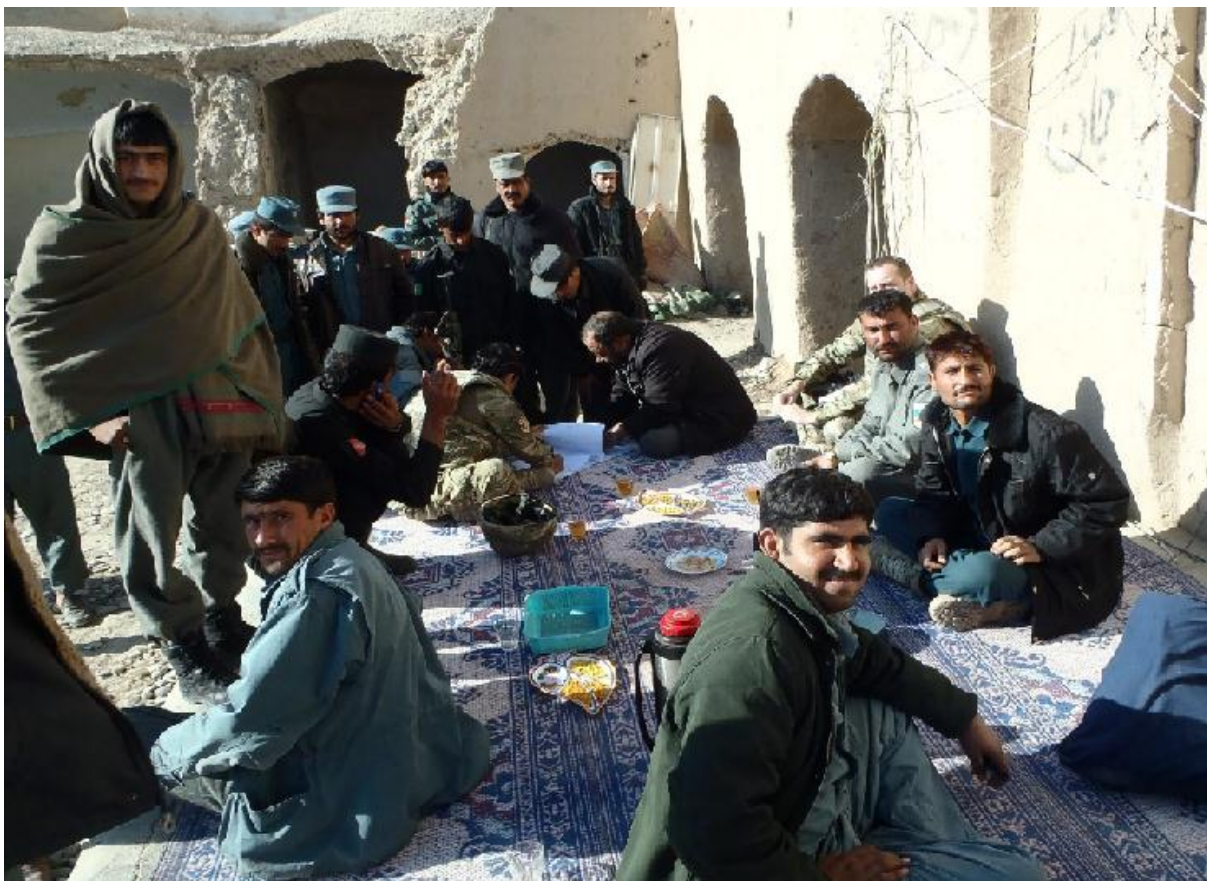
PMAG mentor the police in anything they require. Here our mentees conduct an audit of one of their Check Points.