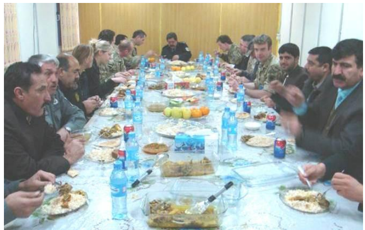
Breaking out the Pepsi, a sure sign that this is a special occasion!