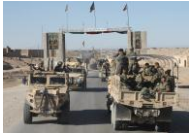
Cover Image: The Commanding Officer's Rover Group pass an ANA convoy at the Gates of Gereshk.