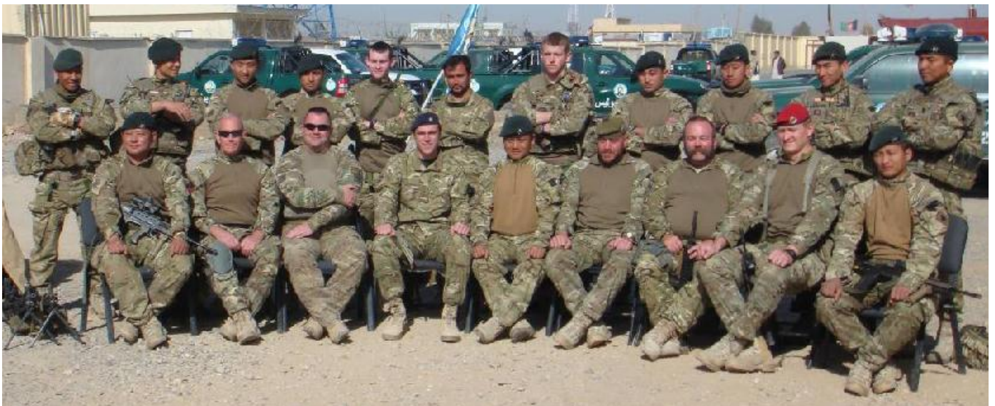
Silicon 41 and Embedded Police Mentors team photo.

As the Sqn Ldr mentions in his introduction, Silicon 41 are almost at the end of our time mentoring the Afghan Uniformed Police (AUP) around the Lashkar Gah District Centre, with only a week remaining at the time of writing. We will then spend a couple of weeks handing back all our equipment and our 5 vehicles in Camp Bastion (hopefully with no major problems) before the majority of the PAT redeploy back to the UK.