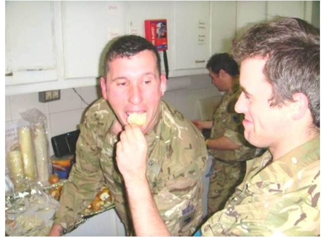
The taste test.

Those staying until the bitter end will continue to work in the Provincial Police Headquarters mentoring both the Coordination Centre and the District Chief of Police. This will provide us the opportunity to stand back and observe as the AUP test the processes we have helped them develop and the Afghan instructors we have trained begin to teach, before we hand over the development task to the Op HERRICK 18 PMAG. I'm not wishing to tempt fate, but at this stage the signs are good for a bright future.