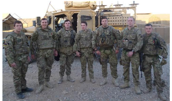
The team just prior to visiting Check Points for chai.