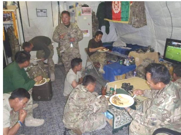
Living up to our stereotype, Silicon 41 enjoy a goat curry

Getting to this point has not always been easy and required real team effort from no less than 5 different capbadges, as well as 3 American civilian policemen. That said, looking back over our tour it has been an excellent experience for all in Silicon 41. Everyone has enjoyed learning about different cultures and the aspects of soldiering that they are used to. Coupled with the successes we have had with the AUP, it has been a hugely rewarding few months and all are justifiably proud of our work. Of course the tour would not have been nearly as enjoyable had it not been for all your support, so I'd like to thank you one last time. It goes without saying that we look forward to seeing you again and for everyone in the Regiment being back together in a few months time.