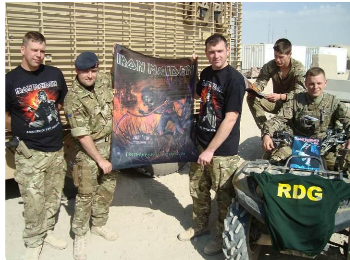
Silicon 666, the callsign of the Beast.