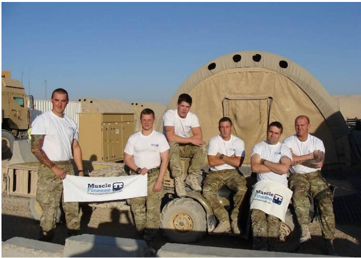
Muscle Beach, Lashkar Gah, 2012.

I would love to write more but the Chief of Staff and the Ops Officer need more coffee, and they assure me that there is only one man in the HQ up to the task of delivering it. I will therefore leave you with thanks once more for your continued support, from all of us in PMAG Headquarters and the Commanding Officer's Rover Group.